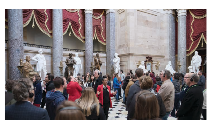
The Capitol Visitor Center is open July 4.