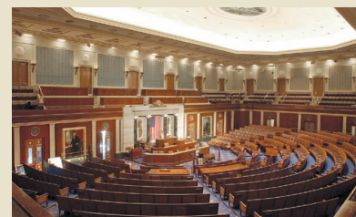
U.S. HOUSE OF REPRESENTATIVES CHAMBER

The Senate and House Galleries are not included in any tour. Passes are required to enter the Galleries. Visitors may obtain Gallery passes from the offices of their senators or representative. International visitors may inquire about Gallery passes at the House and Senate Appointment Desks on the upper level of the Visitor Center.