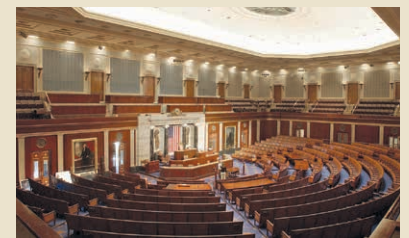
U.S. HOUSE OF REPRESENTATIVES CHAMBER

The Senate and House Galleries are not included in any tour. Passes are required to enter the Galleries. Visitors may obtain Gallery passes from the offices of their senators or representative. International visitors may inquire about Gallery passes at the House and Senate Appointment Desks on the upper level of the Visitor Center.