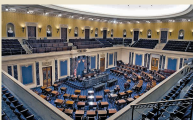
U.S. SENATE CHAMBER

The Senate and House Galleries are not included in any tour. Passes are required to enter the Galleries. Visitors may obtain Gallery passes from the offices of their senators or representative. International visitors may inquire about Gallery passes at the House and Senate Appointment Desks on the upper level of the Visitor Center.