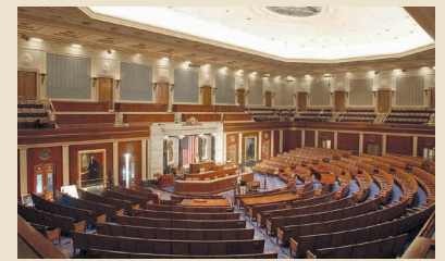
U.S. HOUSE OF REPRESENTATIVES CHAMBER

The Senate and House Galleries are not included in any tour. Passes are required to enter the Galleries. Visitors may obtain Gallery passes from the offices of their senators or representative. International visitors may inquire about Gallery passes at the House and Senate Appointment Desks on the upper level of the Visitor Center.