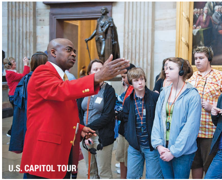
U.S. CAPITOL TOUR

The Capitol Visitor Center will be closed December 25 and will close at 1 p.m. December 24 and 31.