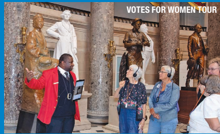
VOTES FOR WOMEN TOUR