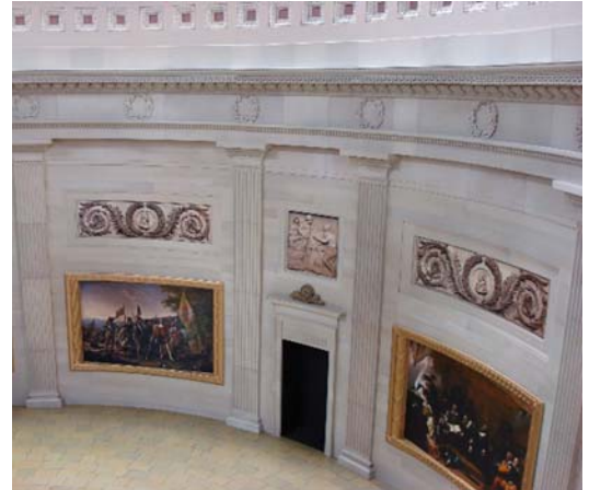
More than two years in the making, a scale model of the Capitol dome has been installed in the Capitol Visitor Center's Exhibition Hall. As seen here, the model faithfully replicates the interior architectural details and artistic treasures of the Rotunda.

To ensure the accuracy of the model, a combination of historical drawings and laser scans were used to make the initial 2-D drawings, verified by an Architect of the Capitol historian. These were followed by 3-D drawings in which features were literally "sculpted" with a computer mouse and converted into molds.