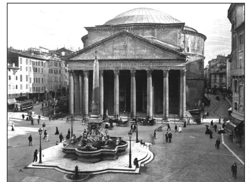
The Pantheon, Rome, A.D. 117-268

The design of the Capitol was inspired by Greek and Roman classical architecture, which included those elements. The nation’s founders were influenced by the ideas and laws of those ancient civilizations. That style can be found in many American government buildings.