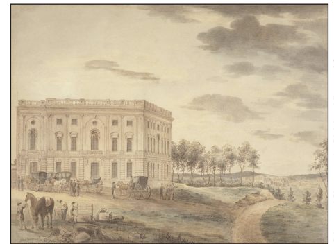
Watercolor View of the Capitol, by William Birch, circa 1800

Construction began in 1793 when George Washington laid the cornerstone. The U.S. Capitol grew in size over time, and enslaved workers built a significant portion. After slavery was abolished in Washington, D.C., in 1862, the remainder of the U.S. Capitol was built by paid workers hired by Congress.