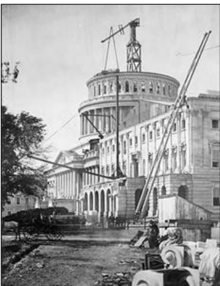
Construction of the Capitol Extension and Dome, circa 1861