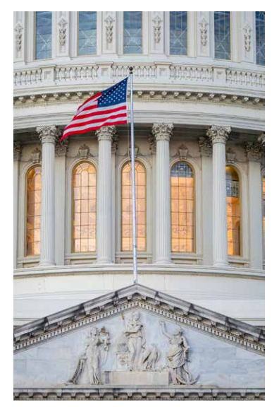
An American flag waves on the east side of the U.S. Capitol, 2022

and national parks across the country. It flies at people's homes during holidays, like July 4th, Veterans Day and Memorial Day. It is often carried at marches and protests.