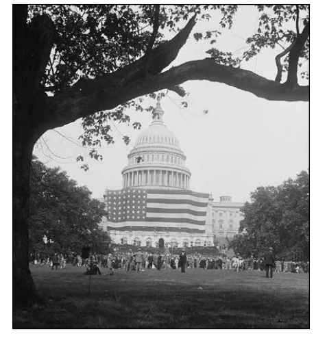
Largest American flag in the world displayed across the front of the U.S. Capitol, 1929

A flag is a piece of cloth, often in the shape of a rectangle, that attaches by one side to a pole or rope. It is used as a symbol of the history, pride and principles of a country or group of people.