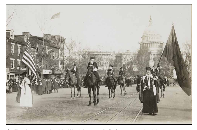
Suffragists marched in Washington, D.C. for women's right to vote, 1913

There have been 27 different versions of the American Flag since 1777. The 13 stripes symbolize the first 13 states in the union. The 50 stars symbolize the current 50 states. The blue stands for justice, the white stands for purity and the red stands for bravery. The current 50-star flag has been in use since July 4th, 1960.