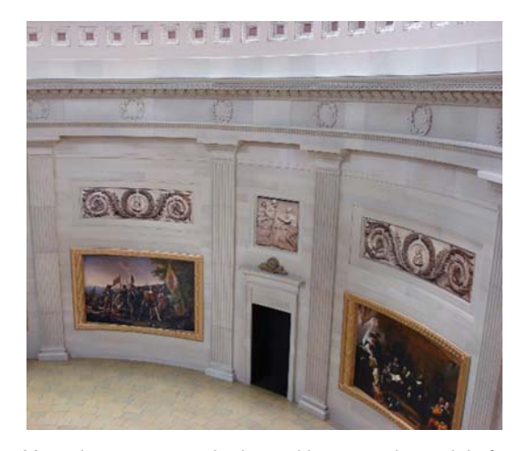
More than two years in the making, a scale model of the Capitol dome has been installed in the Capitol Visitor Center's Exhibition Hall. As seen here, the model faithfully replicates the interior architectural details and artistic treasures of the Rotunda.

Architectural features of the Capitol dome, both interior and exterior, have been meticulously replicated. The front of the model shows the exterior of the dome from its base to the Statue of Freedom. The back side of the model depicts a cutaway showing the construction of the inner and outer cast iron dome and the interior of the Rotunda, from the fresco depicting George Washington to the sandstone blocks of the Rotunda floor.